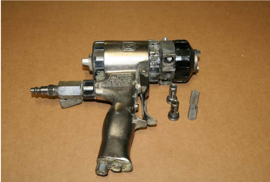
Graco Fusion AP Gun. Remove and leave out gun screens.

5. Use GAP Gun or Fusion AP Gun (not Fusion CS) with #2 or AR5252 mixing chamber. Use steel/metal side seals. Remove and leave out gun screens.