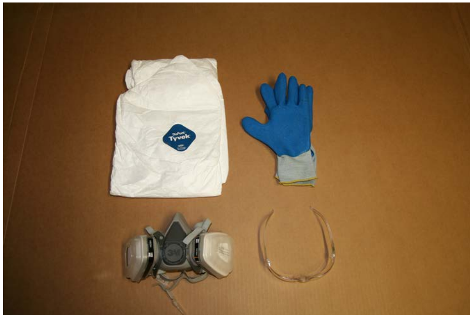
Examples of Personal Protective Equipment