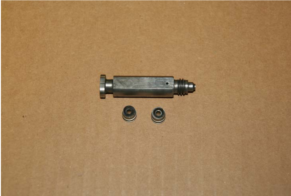
AR5252 mixing chamber and steel side seals for Graco Fusion AP spray gun