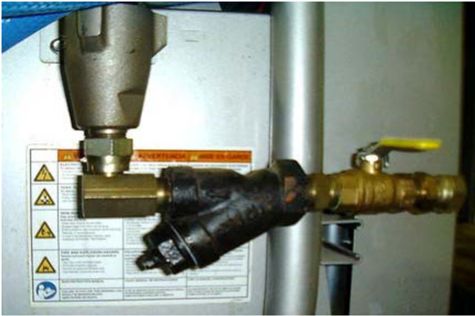
Standard Graco y-strainer